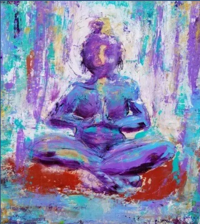
Artwork by Quána Madison

This workshop will stimulate your imagination and channel your inner creativity through a combination of drawing/painting, writing/poetry, dance/movement, music, drama/theatre and art-looking activities.